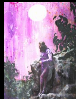
Till Gerhard Am Lago